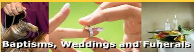
Baptisms, Weddings and Funerals